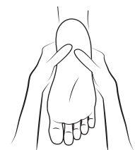
pinpoint zone activation