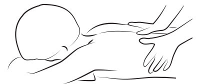
thumb walk tissue pull