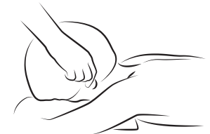
auricular stress reduction