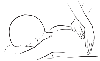
alternating palm slide